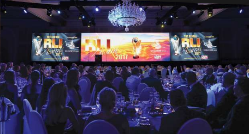
Palazzo Versace Hotel, Dubai, UAE