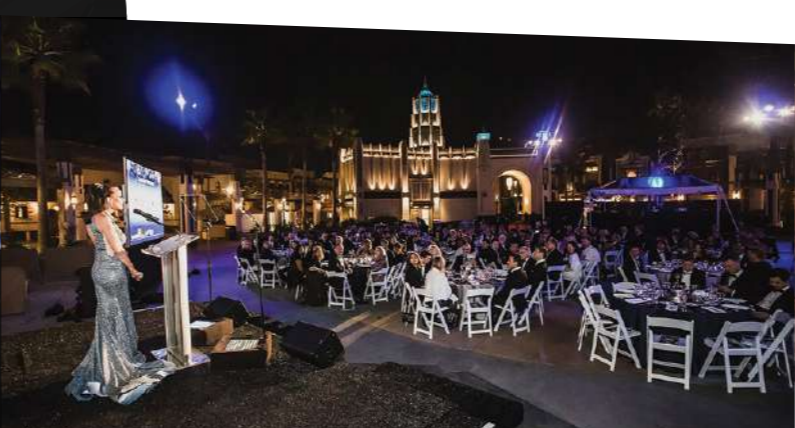
Universal Studios, Los Angeles, US