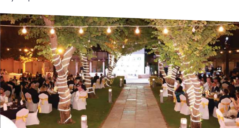
British Embassy, Riyadh, Saudi Arabia