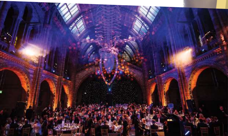
Natural History Museum, London, UK